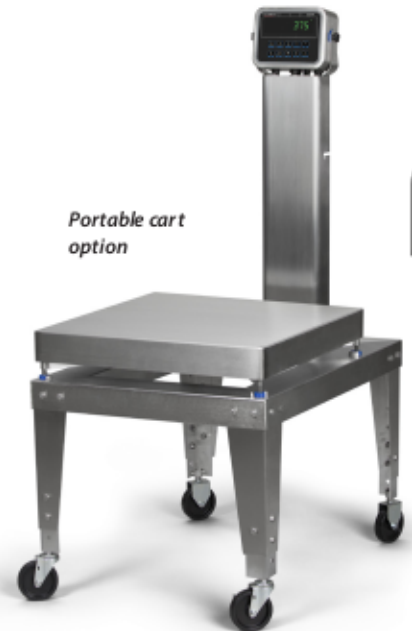
Portable cart option