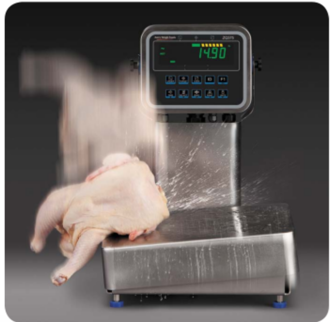
Torsion base features 500% shock loading protection

Able to withstand up to 500% shock loading, our breakaway load transfer system helps to guarantee accuracy and reliability at all times. This specialized base automatically transfers shock loads and overloads away from the load cell back to the base frame, ensuring that the scale's accuracy and performance is not affected. Unlike other designs used to reduce shock loading, this food grade stainless steel design offers a clean and uncomplicated solution that is fully NSF Certified and washdown resistant.